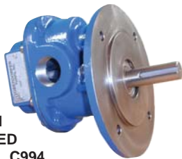
DUCTILE IRON CLOSE COUPLED C994