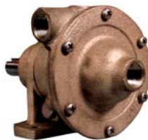
BRONZE CENTRIFUGAL 50P