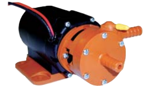
PLASTIC CENTRIFUGAL 144