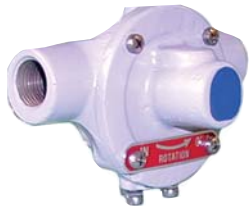
RUBBER ROLLER 310F