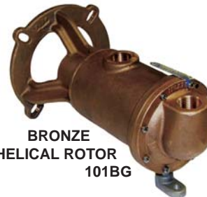
BRONZE HELICAL ROTOR 101BG