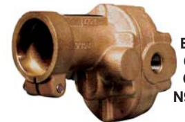
BRONZE CLOSE COUPLED N991