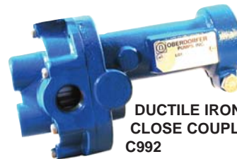
DUCTILE IRON CLOSE COUPLED C992