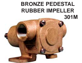
BRONZE PEDESTAL RUBBER IMPELLER 301M