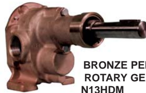
BRONZE PEDESTAL ROTARY GEAR N13HDM