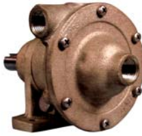
BRONZE CENTRIFUGAL 50P