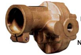
BRONZE CLOSE COUPLED N991