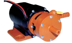
PLASTIC CENTRIFUGAL 144